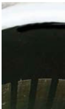
Fully Encapsulated Winding and Junction Box.