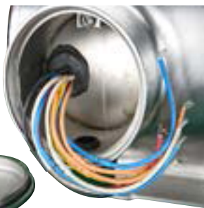
Color Coded Lead Wires